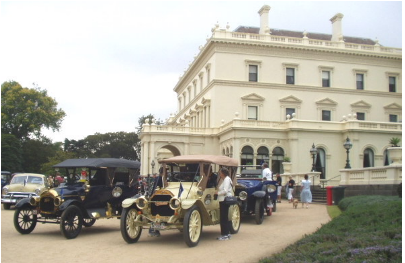
Above: Government House – Start of magnificent auspicious tour. Below: On route in Hamilton