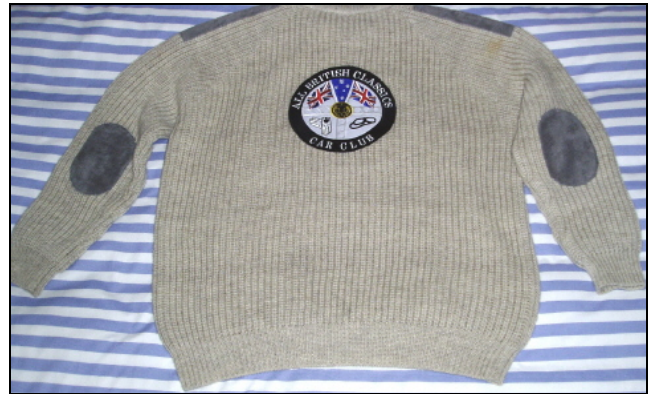
Front (left) and rear (right) views of the Jumbuk Jumper, note ABCCC badge patches and the leather shoulder and elbow protectors.

These super winter quality jumpers are crafted from wool that is unique in this country. Jumbuk Wools is the only company that manufactures naturally greasy garments, from washed fleece to finished product, under the one roof. Some lanolin is left in Jumbuk Wools to give you all the natural benefits – extra warmth, resilience and water resistancy. The wool is soft, springy and durable – it holds its shape well, yet is quite soft for you to wear.