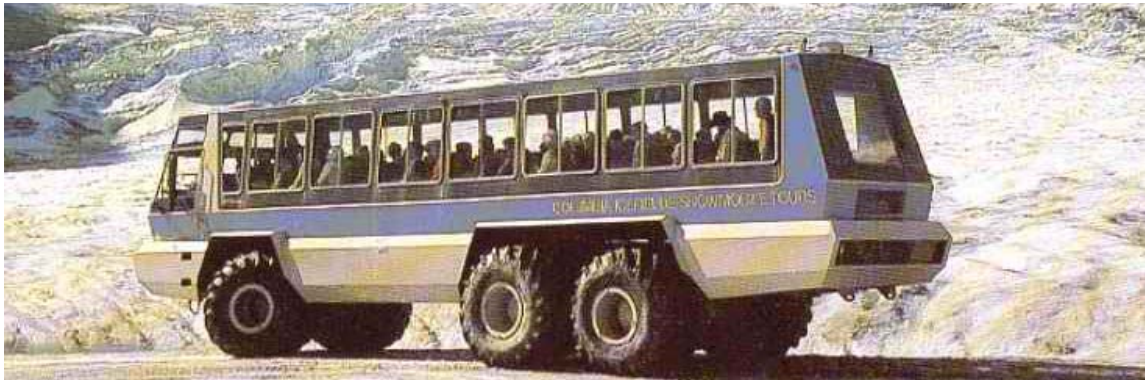
We are off on an omnibus tour! But not on the Athabasca Glacier in a Snow Coach!