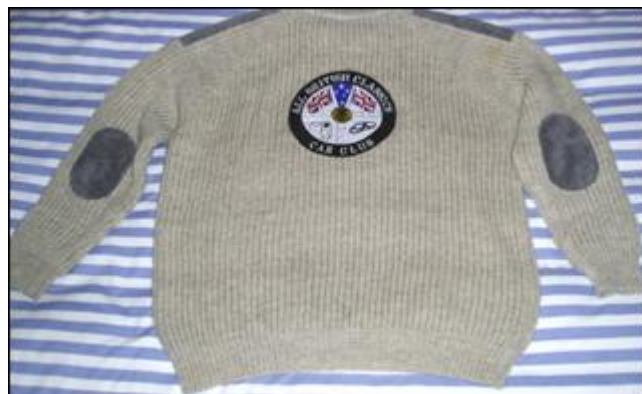
Front (left) and rear (right) views of the Jumbuk Jumper, note ABCCC badge patches and the leather shoulder and elbow protectors.

These super winter quality jumpers are crafted from wool that is unique in this country. Jumbuk Wools is the only company that manufactures naturally greasy garments, from washed fleece to finished product, under the one roof. Some lanolin is left in Jumbuk Wools to give you all the natural benefits – extra warmth, resilience and water resistancy. The wool is soft, springy and durable – it holds its shape well, yet is quite soft for you to wear.