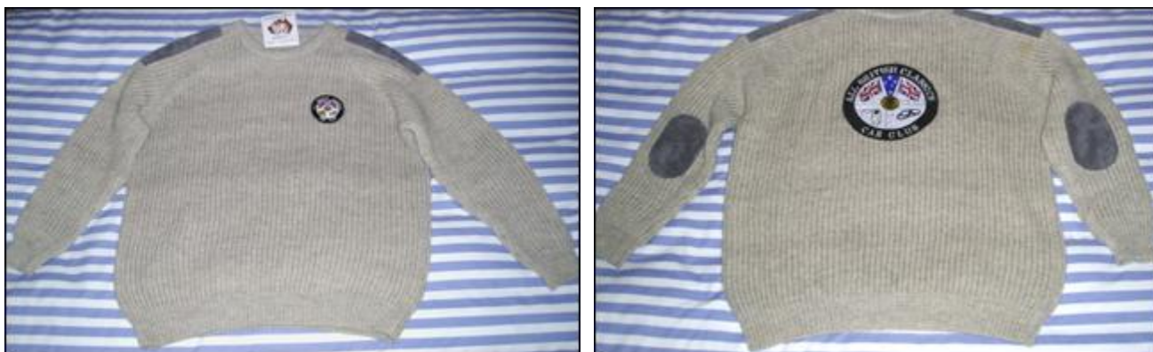
Front (left) and rear (right) views of the Jumbuk Jumper, note ABCCC badge patches and the leather shoulder and elbow protectors.

Pictured below is a superb pure wool, hand crafted Jumbuk Jumper, just right for those winter days, and on Spirit of Tasmania's deck during crossing. These jumpers are made especially for the ABCCC and there is an exclusive offer on them for our members.