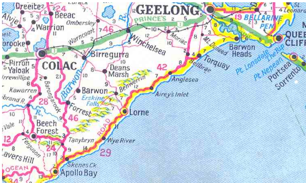
Great Ocean Road from Torquay to Apollo Bay (Distances shown in miles)

BRING YOUR CLASSIC CAR, TOUR DATE: 30 th & 31 st OCTOBER, 2004