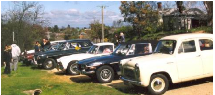
Some of the cars lined up outside Buda House.

Here were presented with a comprehensive goodies bag with brochures and snacks. Soon, it was time to drive on to Castlemaine, the objective of our day's activities. Our first stop was for a guided tour of Buda House, up on the hill overlooking south-east Castlemaine.