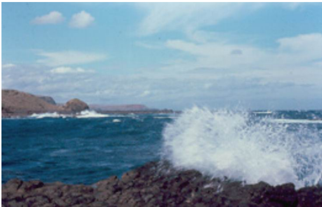
The beautiful Phillip Island Bass Strait coast, looking towards Cape Woolami.

Let's start the new year's events for the ABCCC with an interesting and entertaining weekend in the Gippsland and Phillip Island area. On the Saturday morning we will meet at 10:00 am at Caldermeade Farm, approximately 15 kilometres southeast of Tooradin on the South Gippsland Highway (M420), where we shall partake of Devonshire Tea or coffee. We will then take a scenic drive to Wonthaggi for lunch.