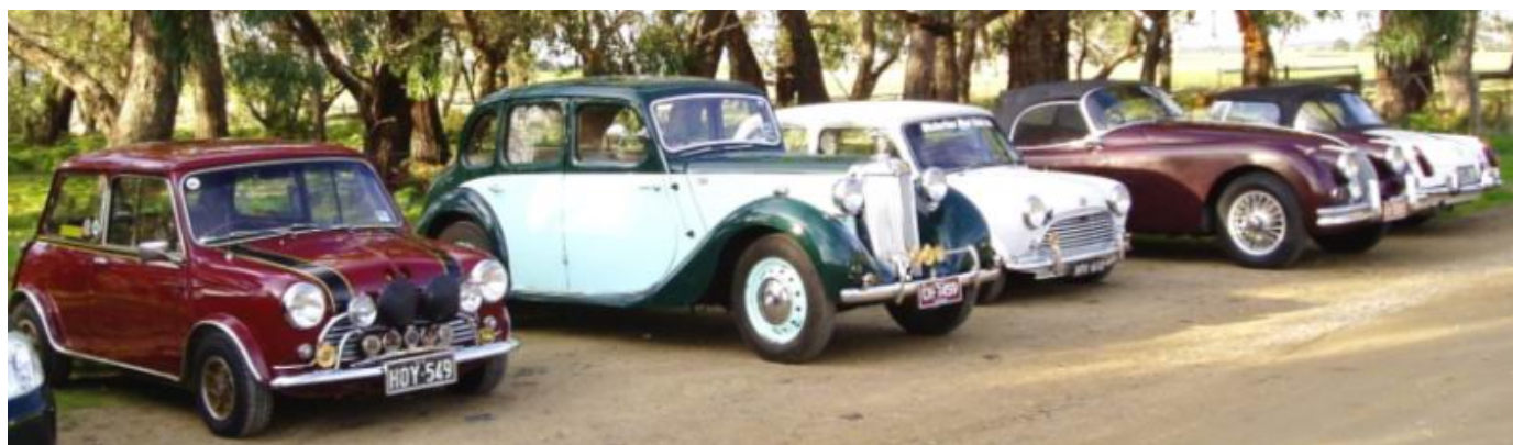
Line of cars on popular Peninsula Run – June, 2004.