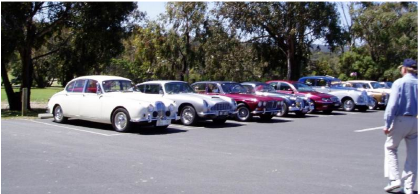
Cars basking in sunshine at Anglesea Golf Club, left to right – Daimler, Aston Martin, Jaguar XJ-6, Jaguar XK150, Rover, Armstrong Siddeley, Alvis, Rolls Royce (2). A fine variety of six and eight cylinder British engines.

While we had a superb lunch, we did see some kangaroos hopping around the practice green. It was in the car park that the participating cars were lined up for a photo session.