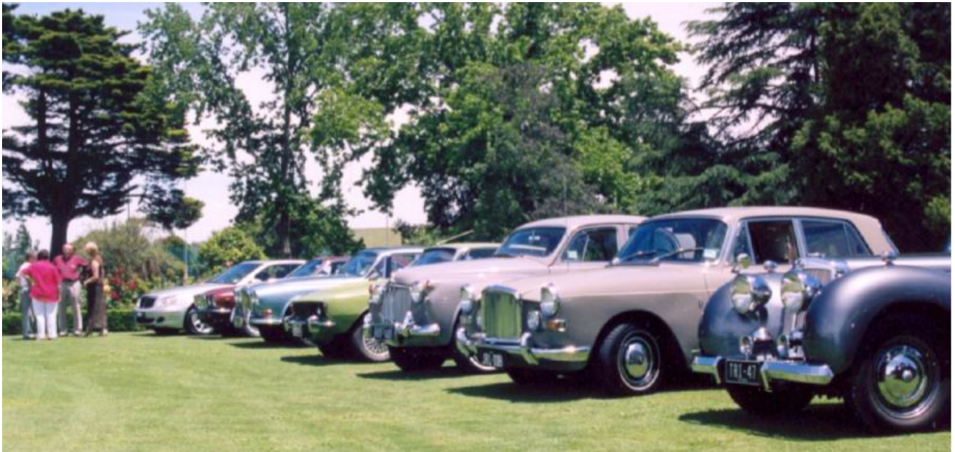
Line up of fine British Classics, the modern German sneaked in somehow!

A wonderful lunch was enjoyed by all, the chicken pieces were exceptionally delicious. After the meal our President gave an oration thanking those who had helped make the year's activities so successful and a special welcome was extended to our visitors from England. Then we spent time admiring the cars lined up on the lawn. There were splendid examples from Rover, Jaguar, Triumph, Van den Plas (Austin), MG, HMB, and, a Euro ring-in, Mercedes-Benz. There were some others parked under the trees that the writer can not accurately remember. Apologies for missing any marques.