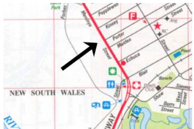
Arrow shows approx location of motel.

It is proposed that on one evening we have a barbecue evening meal in the motel's courtyard that is sheltered on three sides and can seat thirty people. It is also anticipated that we will travel to Moama via Shepparton, so that we can visit the Goulburn Valley Motor Vehicle Drivers Club's clubrooms. Our display at the steam rally will be on the Sunday. More on this later. Be sure to get your bookings in at the River Country Inn soon!