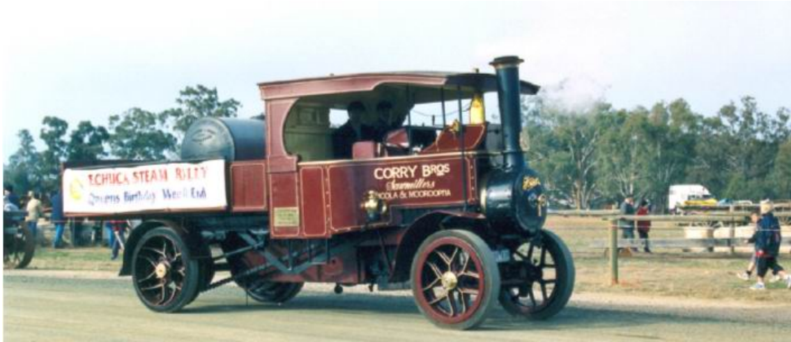
At the Rotary Steam Rally, Echuca.