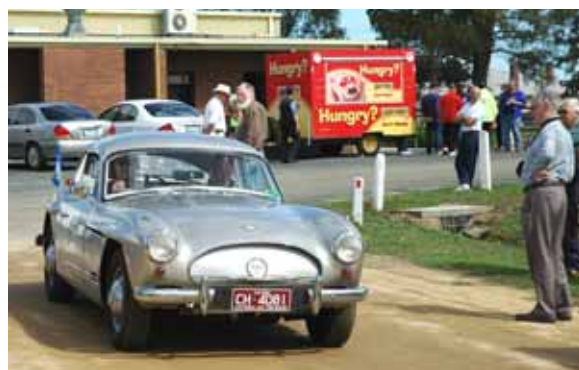
Nice to see one of these Jensens again!

Images from the 2007 RACV Fly The Flag Tour.