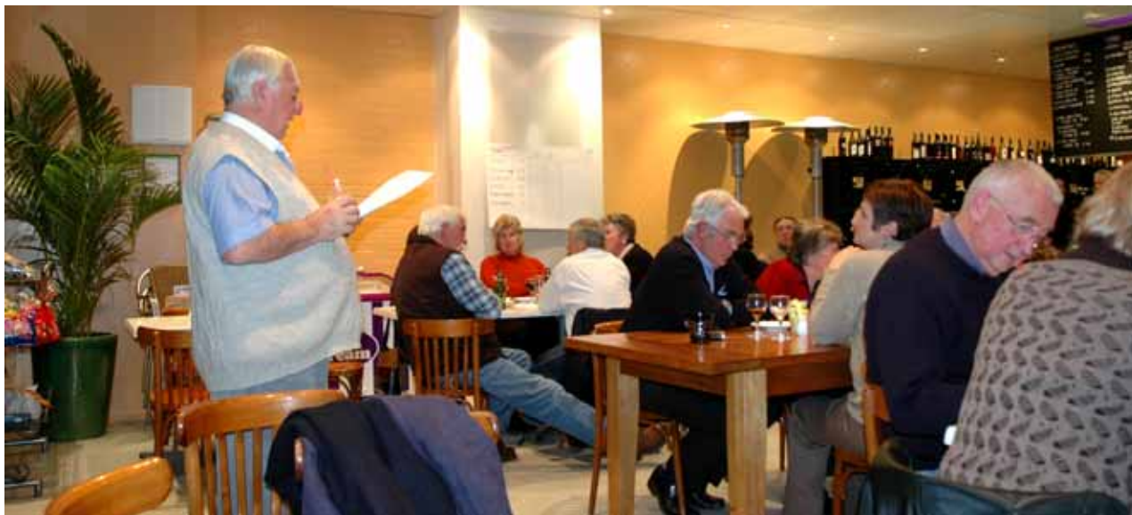
A SCENE FROM THE 2005 GREAT ABCCC TRIVIA CHALLENGE – NOTE THE AURA OF CONCENTRATION!

IF YOU DO, THEN YOU ARE WELL ON THE WAY TO COMING ALONG AND HELPING TO MAKE UP A TEAM FOR THIS CHALLENGE OF SUPREME KNOWLEDGE OF THINGS MOST TRIVIAL!