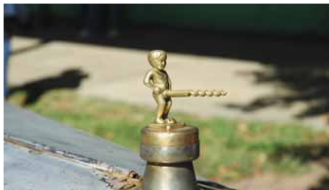
The radiator cap that so fascinated Tore Panuzzo.