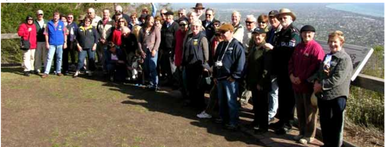
Above: Our group, minus one (or three) at Sea Winds Park Lookout.

I can report that the pilot and navigator of the Red Scimitar GTE consumed a hot Cornish Pasty and a Sausage Roll respectively, and have no hesitation in recommending the produce from the Balnarring Bakery. Morning tea was as planned with some of our tribe opting to visit the special chocolate shop. Then a scenic drive through peninsula country to a magnificent lookout with a panoramic view of Port Phillip Bay, a memorable sight indeed.