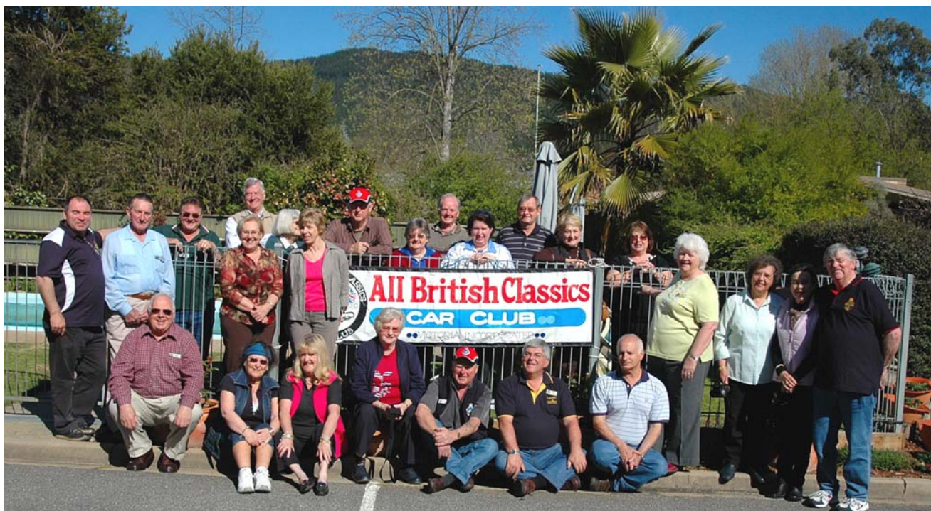
Our Indulgence Tour group, all of us, happily fully indulged after a wonderful weekend!