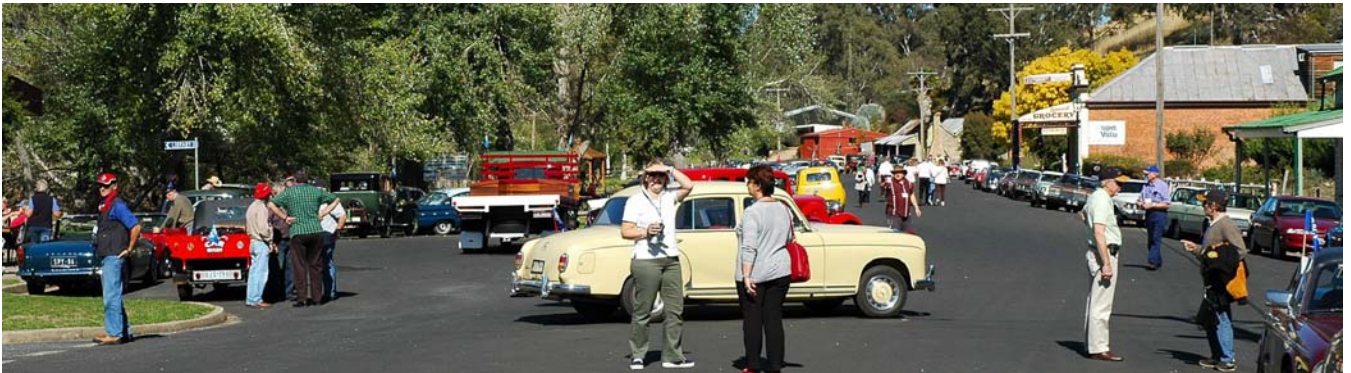
Above: Harrow, filled with heritage cars and trucks.

The big one! Pynsent Street was closed off for our flag-off ceremony and, after a bountiful breakfast in the Town Hall, we were ready for the start to a day of super-perfect touring. The actual flag-off was arranged so that ten cars at a time entered the roundabout in Firebrace Street where the police obligingly assisted a very smooth flow of Tour cars towards the primary school where the youngsters enthusiastically waved flags to friendly toots from many car horns. It was a perfect sunny morning as we headed along the Wimmera Highway towards Natimuk. We soon spotted the Tour Direction Sign at the turn-off for Balmoral. We had the lonely roads to ourselves. The drive to Harrow was just magic. The roads were good and we were soon there for a pleasant morning tea. The wonderful ladies from the Harrow Bush Nursing Home ably sold us good refreshment in aid of their Home.