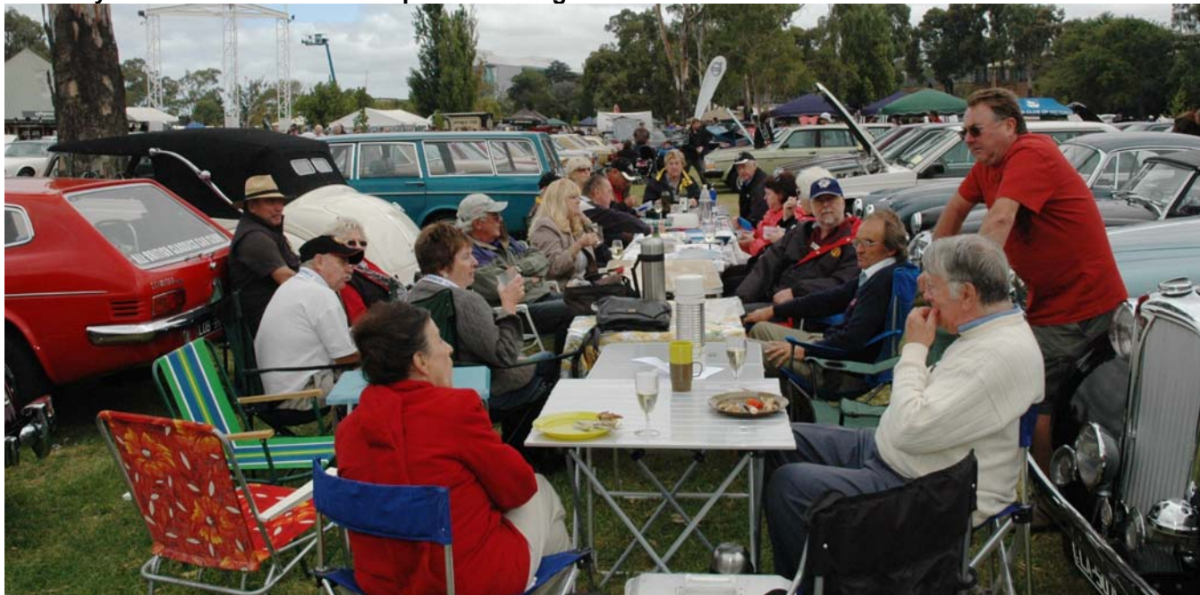
The Long Lunch – to a backdrop of Volkos!

Formerly The AOMC British & European Motoring Show