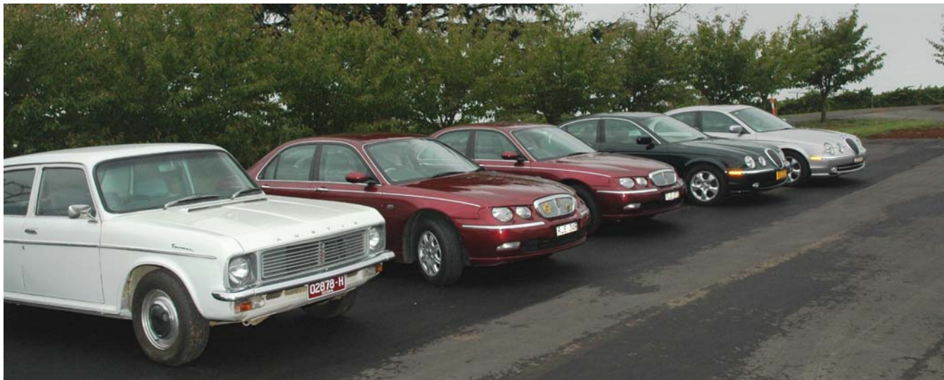
An Aussie Classic and its future classic brethren. It was that dark, the camera's flash took over, note Jaguar reflectors.

As we approached our usual meeting point, the weather looked a bit grim; Plan 'B' might have to be brought into play. The wind was fresh and rain clouds hovered around us, but at the Lilydale International Club, it stayed dry. In deference to recent hail storms, we took the young Rover and left the Jowett in the garage. A sizeable group of us gathered in readiness for the start of our day's adventures.