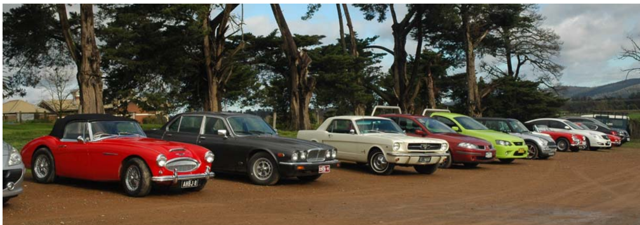
Just some of the fine motor cars on our Yarra Valley Run.