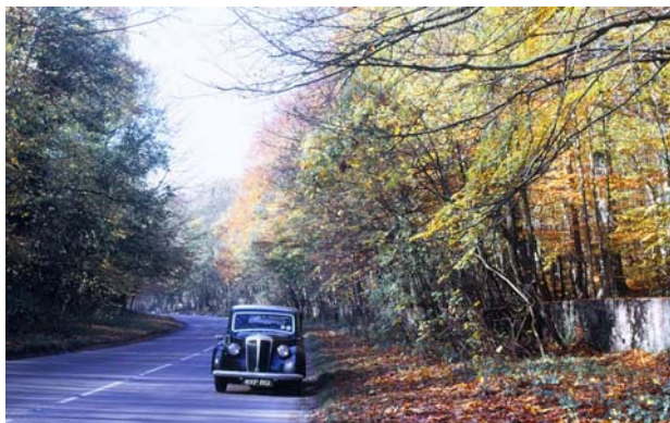
Left: The family DB18 motoring up Clarken Coomb near Bristol. Autumn 1960.

At that time, we lived on an eight acre property near Clapton-in-Gordano, and the 'new' Daimler was soon fitted with a tow bar for the small farm trailer. This was a motor car that my mother approved of greatly. It was comfortable, easy to get in and out of, and its heater was totally leak proof. This car served us well for a number of years, and it was replaced by the same model, but a bit younger. It was also bought locally.