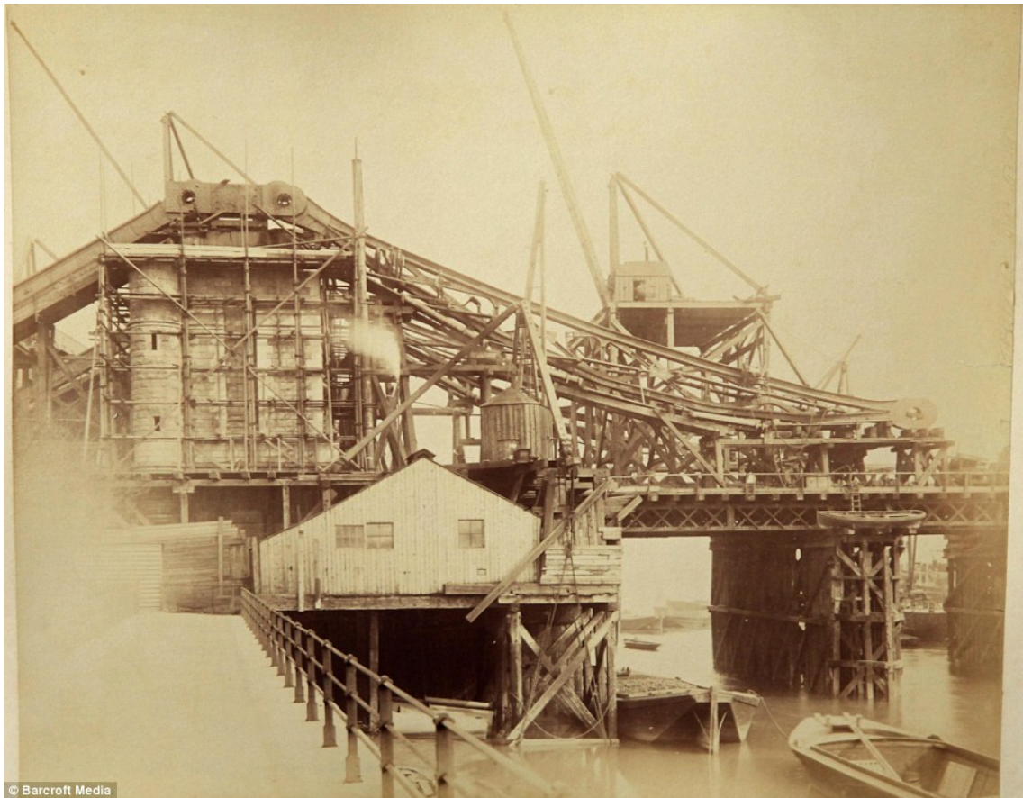
Development: Photos show the progress in the construction process, from basic structures to something easily recognisable as Tower Bridge as we know it today