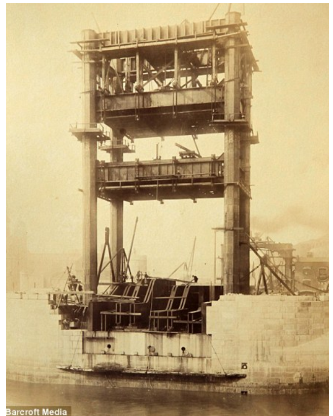
Transformation: The bridge took eight years to build and at the time was a landmark feat of engineering, combining elements of a suspension and high level bridge and a bascule