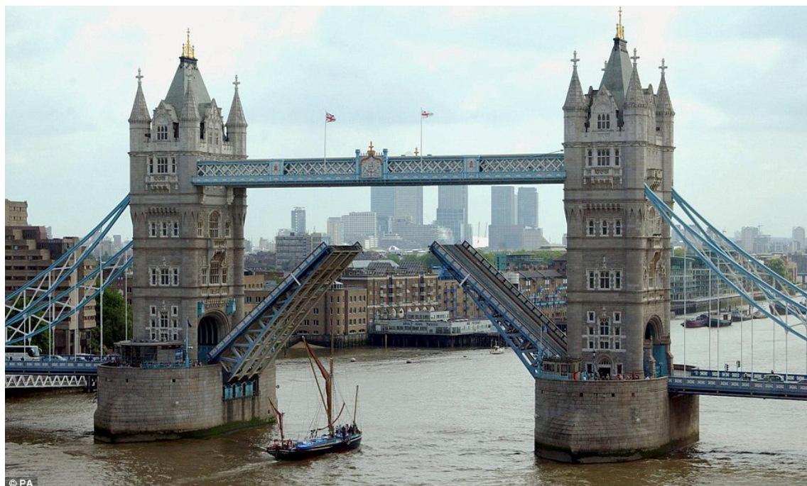
In 2012: Tower Bridge remains one of the capital's most iconic structures and featured strongly in the recent Olympic Games' opening and closing ceremonies. The paint colour scheme of red, white and blue was applied for the Queen's Silver Jubilee celebration.