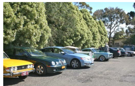
Above: Images from Phil's Touring Day Out – Sunday 23 rd September.