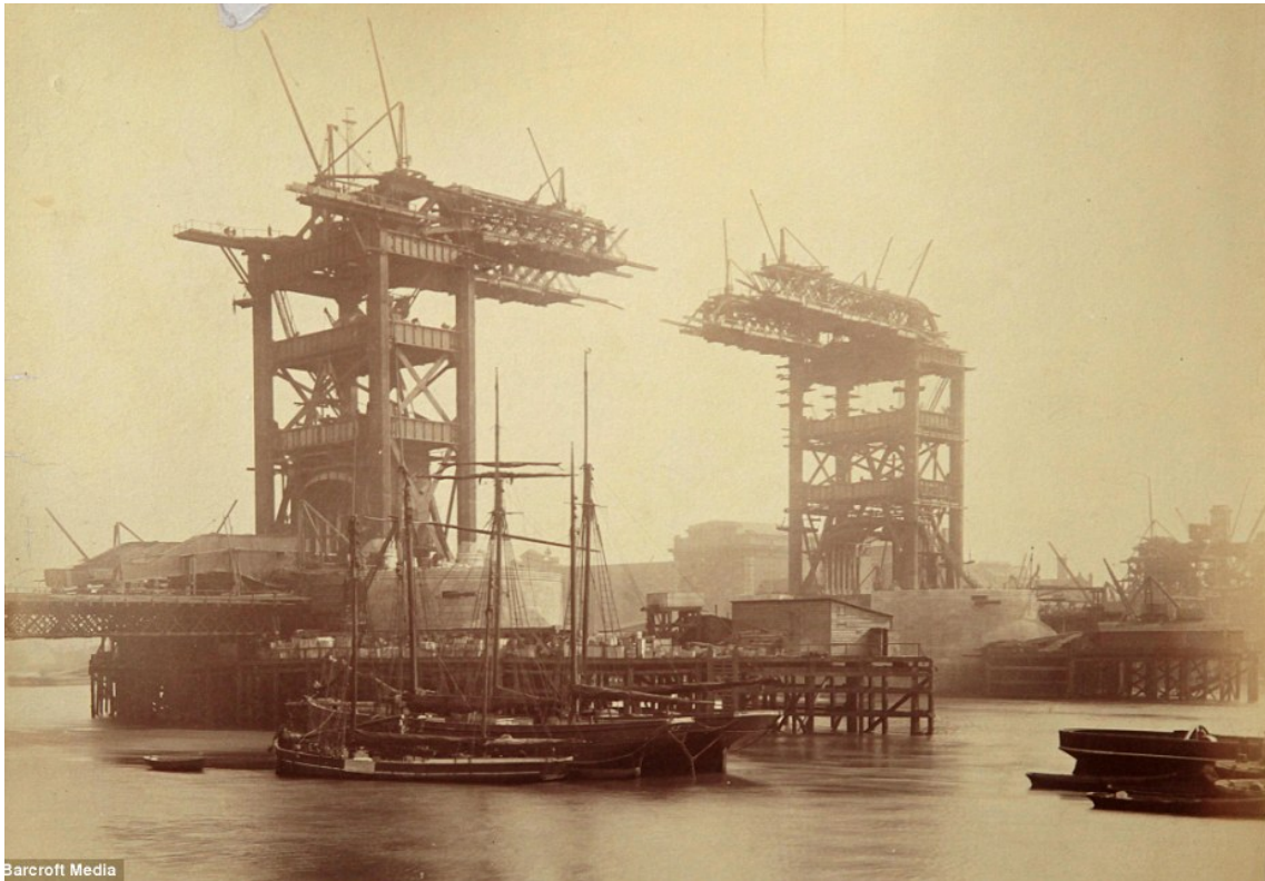
Figure 5. A view of the bridge: The sturdy steel frame of Tower Bridge can be seen, before it was covered with its distinctive stone-cladding on the orders of architect John Wolfe-Barry