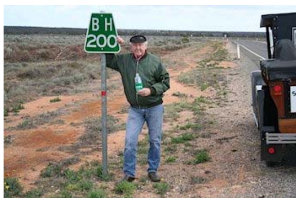
Left: 200 k's to go!

On arrival at Broken Hill late in the afternoon, we booked into the Palace Hotel. We parked around the back of the pub, right next door to a bikie hangout! Priscilla, Queen of the Desert was filmed at the hotel with 2 pink flamingos parked outside. There are many different original murals everywhere. They were painted by the original owner, fascinating stuff! The room was adequate and the