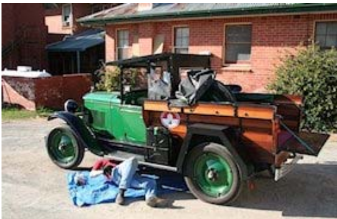
Left: Adding the much needed oil

The pub was straight out of the 30's/40's with lots of timber and old tile floors. The meals were good and the room was comfortable. In the morning we had to try and solve the gearbox problem, so Ray did some investigation and found there was very little oil in it! Being the stickler on maintenance, he was somewhat perplexed. The Chevy has a system that allows oil from the gearbox to flow into the differential. (I don't fully understand it), so in went some oil and hey presto! Problem solved.