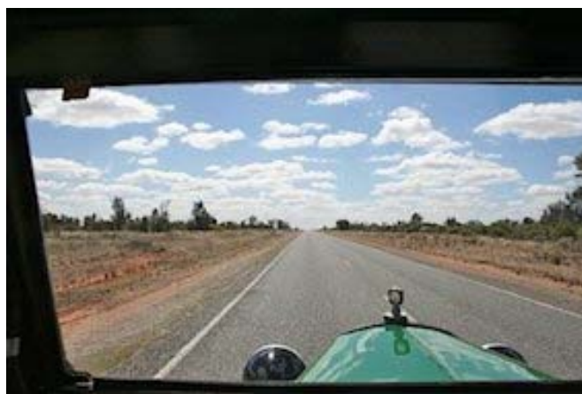
A long road ahead.

The rest of the journey to BH went without a hitch; the road was absolutely amazing. At the speed we were travelling you could see and hear the varieties of animal and bird life. We stopped and had a look around a few times. You are more aware of the sheer size and desolation of your surroundings. The trouble today is that life goes too fast to appreciate this wonderful country.