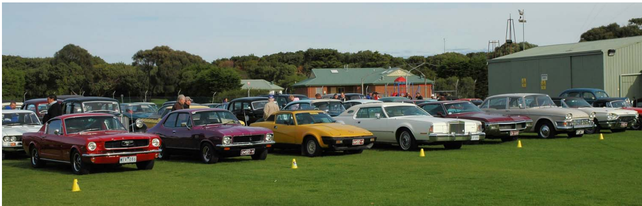
Above: At left is the small witch's hat that one of our members drove over while finding a parking spot!

Next time you visit the City, glance down at the well-laid paving flag stones and some of the decorative stone facings on buildings. Chances are, you will be looking at the work of expert stone handlers from Bamstone's works. In some slices we could see veins of volcanic activity from all those years ago. A huge radial arm circular saw with diamond tipped blade teeth was demonstrated to us. Vast flows of cooling water are pumped to the cutting face and the finished cut is very smooth indeed. With respect to the stones shown above, exceptional skill is required for knowing where to make the first cut. Most of the bluestone is now cut for decorative purposes.