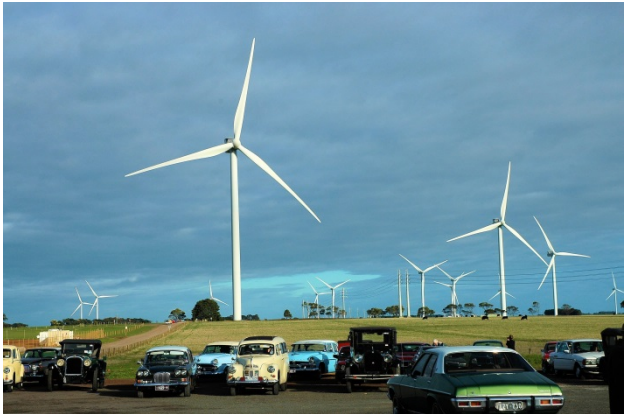
Above: Just a small portion of the wind farm.

The wind farm was an enormous surprise – the sheer vastness of about 144 wind generators spaced around the property; the size of each generator; and, for me, the surprise of not seeing piles of dead birds, cattle and sheep lying around as the protesters informed us there would be. Sheep and cattle were calmly grazing beneath the huge rotating propellers.