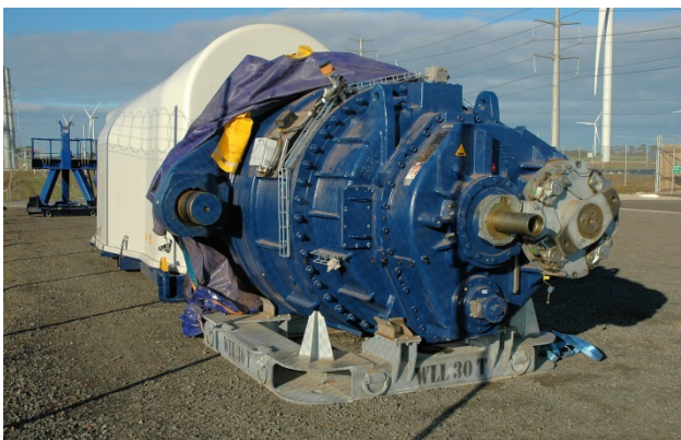
Above: This is a spare gearbox for a generator.

We formed an orderly queue for a look inside one of the towers. It was at this point that the enormity of things around us really started to sink in. The land area of the Macarthur Wind Farm is 5,500 hectares and, once inside the tower base, about six or eight at a time, we could see how big the towers really are. There is a one-man lift built in that goes virtually to the top. A short ladder provides access into the generator's housing for servicing purposes.