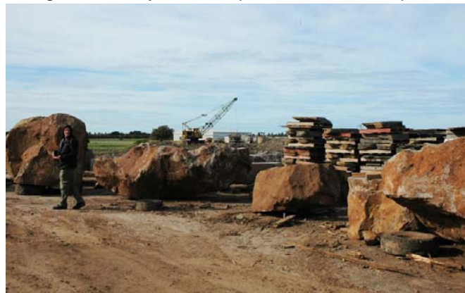
Left: Some large stones await cutting at Bamstone.

Next morning, it was quite cold for initial engine starts, but we all made it to the showgrounds for our briefing before heading off to see how those huge slices of the local