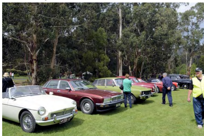
Above: A part of our Saturday display.

COMO GARDENS OPEN WEEKEND – Saturday 17 th and Sunday 18 th October, 2015