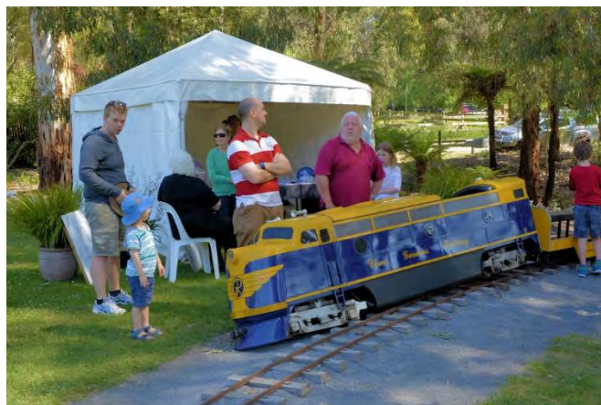
Above: The young boy at left, in the blue hat, was quite distressed, however, the maintenance team, using a stout crow-bar soon had the train running again.

A fair amount of dust was raised by moving vehicles on both days, a bit different from the muddy conditions of the April weekend. On both days we had a good line-up of classic cars, backed up against the Como Gardens Railway track. Speaking of which, there were a couple of derailments on the curve right at the main entrance! It was a bit like our Public Transport Victoria's eastern approach to Box Hill station.