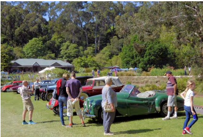
Above: The Sunday car park display in perfect sunshine.

A good number of ABCCC members helped with other activities – train driving and conducting, keeping up a good supply of scones with jam and cream, manning the public entrance gate and helping with many other things. It was understood that the Sunday could well have broken attendance records. Thanks are due to the folk at the St. John Ambulance brigade for keeping us supplied with drinks and sustaining food. Furthermore, thanks are due to those ABCCC folk who helped out on both days. The Knox SES and the St. John Ambulance people must have benefitted handsomely from our combined efforts.