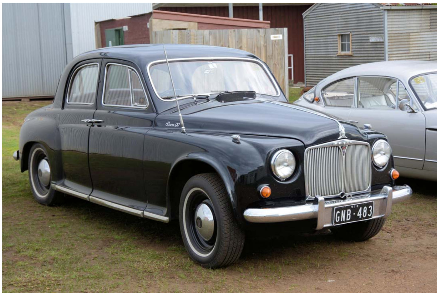
Bill Allen's 1956 Rover P4 90

(unless you are watching an old BBC mystery episode)