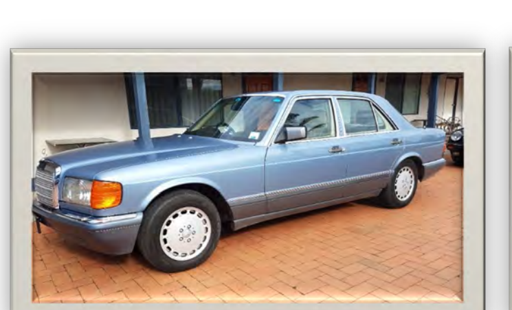
Your ABCCC News - Issue 260 - December 2021

Photos below and on the next page of the Members cars on the 'The Lakes' tour. If you look closely some of the owners have been caught taking the time out to relax and enjoy their time away. Can you spot them?