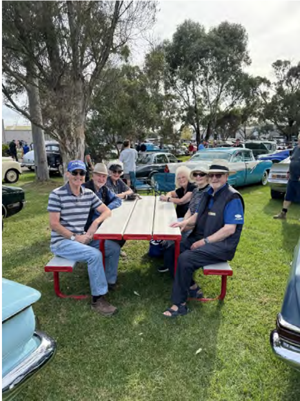
ABCCC members enjoying the event