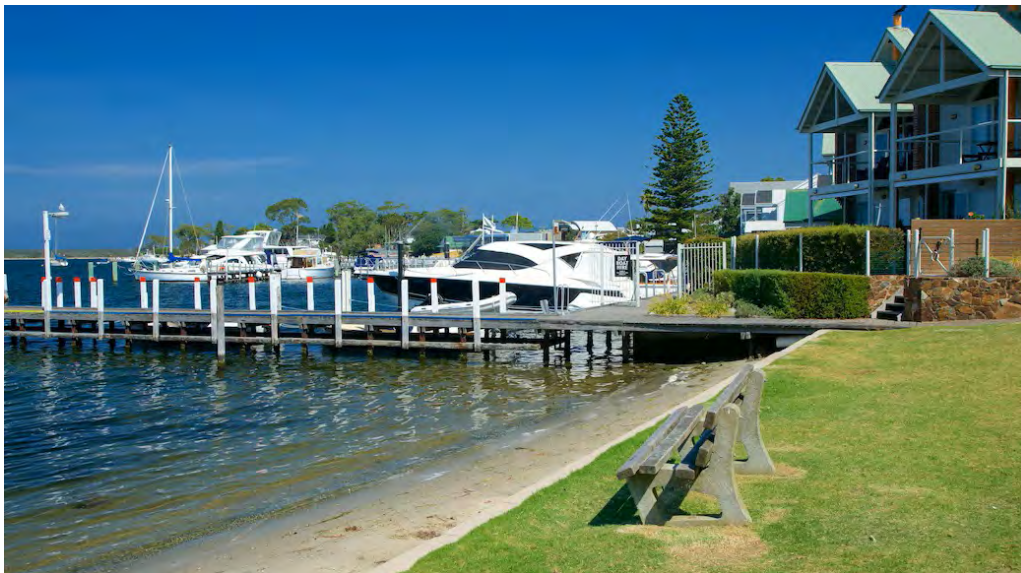
View of Metung

Departing Omeo on Tuesday 12 th May 2026 after checking out we will head to Bairnsdale. We have reserved 10 rooms at the Mitchell On Main Motel at 291-294 Main Street, Bairnsdale, phone number 51525012 for one night at a quoted cost of $160.00 per night. Wednesday 13 th May after checking out that will be the end of the organised tour, you can of course choose to spend a few days at Metung or Paynesville or both, enjoying the Gippsland Lakes.