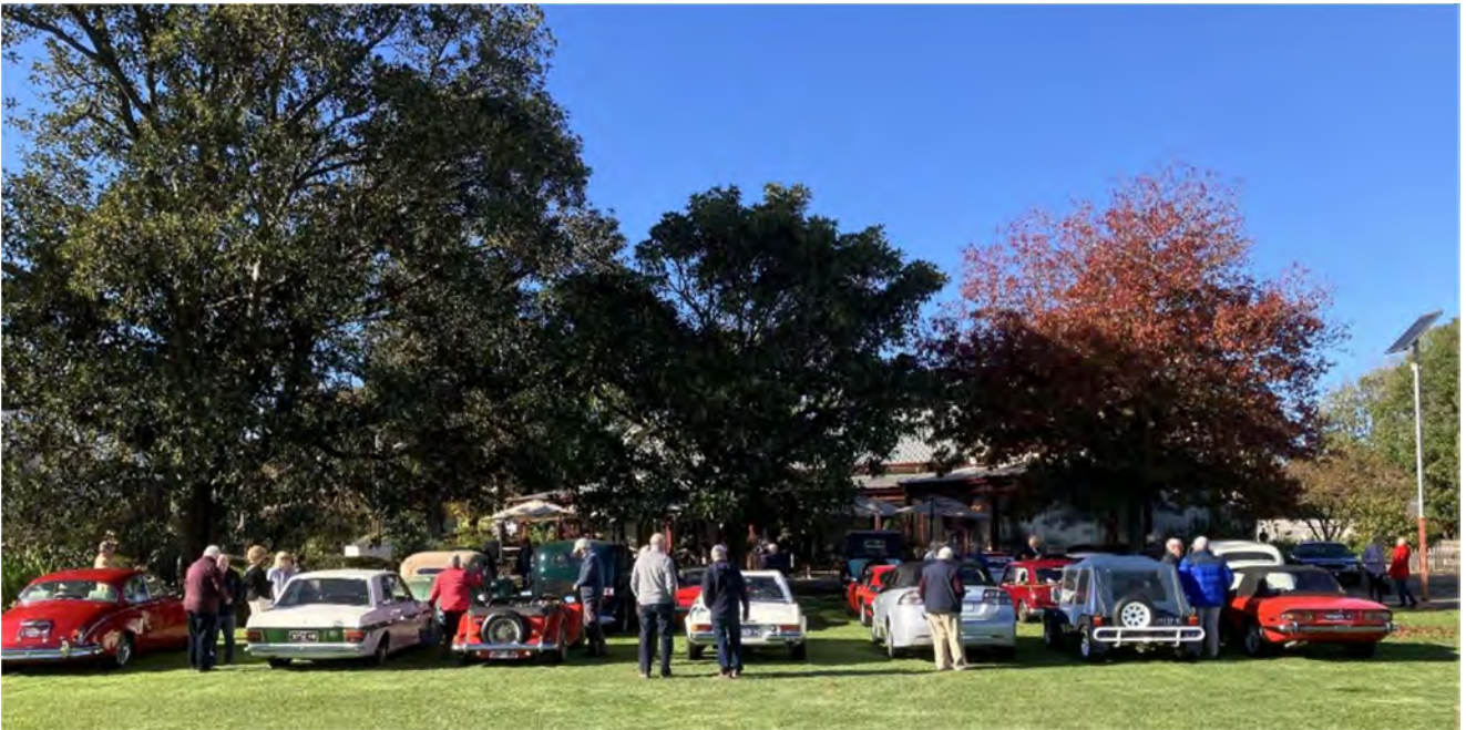
Stamford Park Homestead 8 Emmeline Row, Rowville.

From positive feedback from members with the visit and lunch at the Stamford Park Homestead in May 2025, we have decided to revisit the Historic Stamford Park Homestead for Lunch and to display our Classic/Vintage cars on the lawns just in front of the historic Homestead. An opportunity for a photo of the vehicle's celebrating National Motoring Heritage Day with the Historic Homestead in the background.