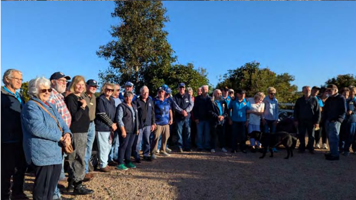
This photo is of All British Classic Car club with BCCC and EGHAC.